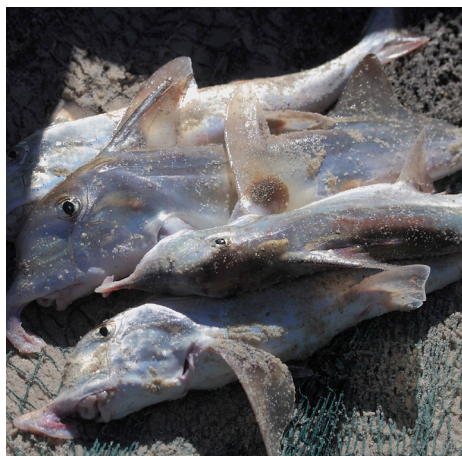
St Joseph is a silvery, bottom-dwelling cartilaginous fish of the family Chimaeridae (ghost sharks, ratfishes, chimaeras) with a bizarre-looking, hoe-shaped snout, which houses a sensory organ for detecting bivalves and other invertebrates in the sediment.

There are only two types of fisheries which are permitted to use gillnets, the Commercial-scale gillnetting in the Western Cape and the KZN bather safety / shark nets - KZN Sharks Board. The legal gill net fishery in the Western Cape is largely confined to the shores of the Western Cape, where there are currently 162 rights-holders with permits awarded solely for the capture of mullet/harder, Chelon richardsonii , and St Joseph, Callorhinchus capensis .